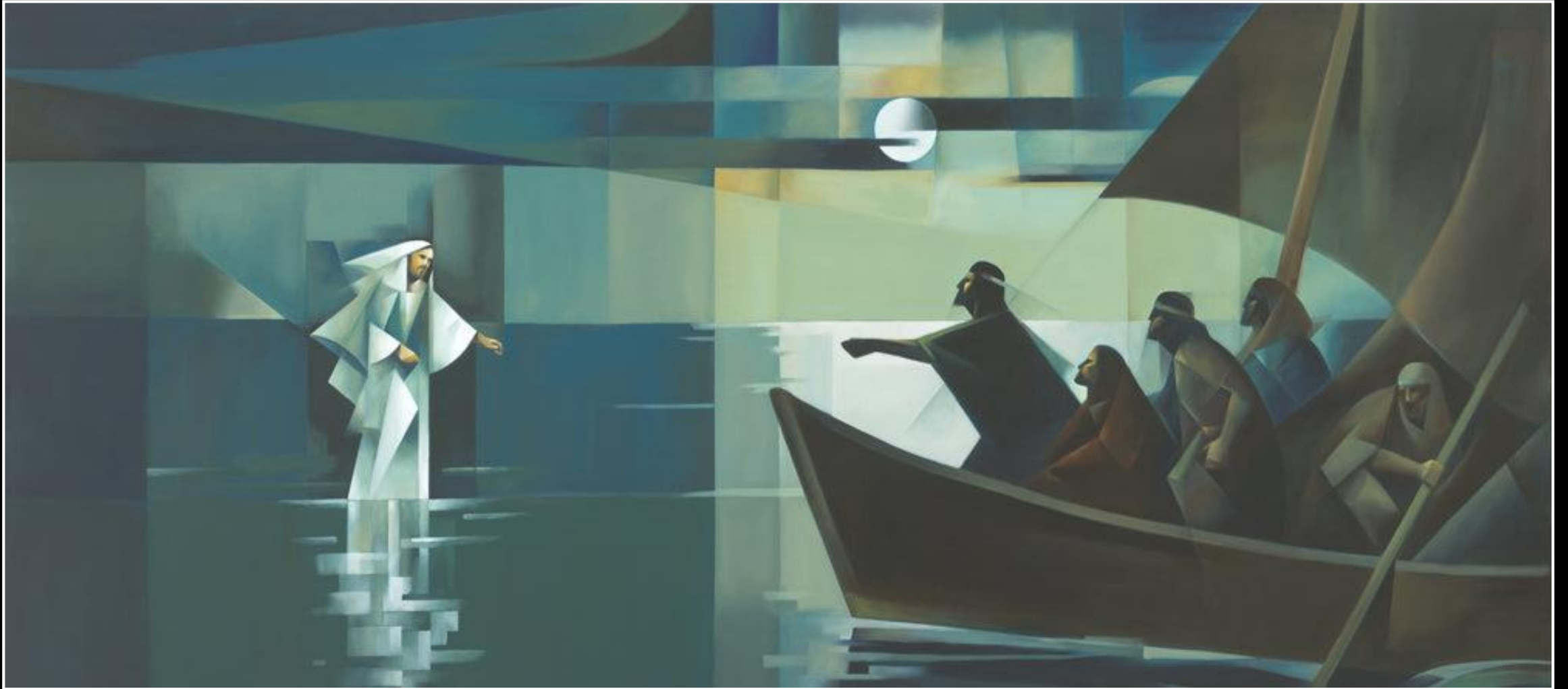
Jesus Walks on the Water