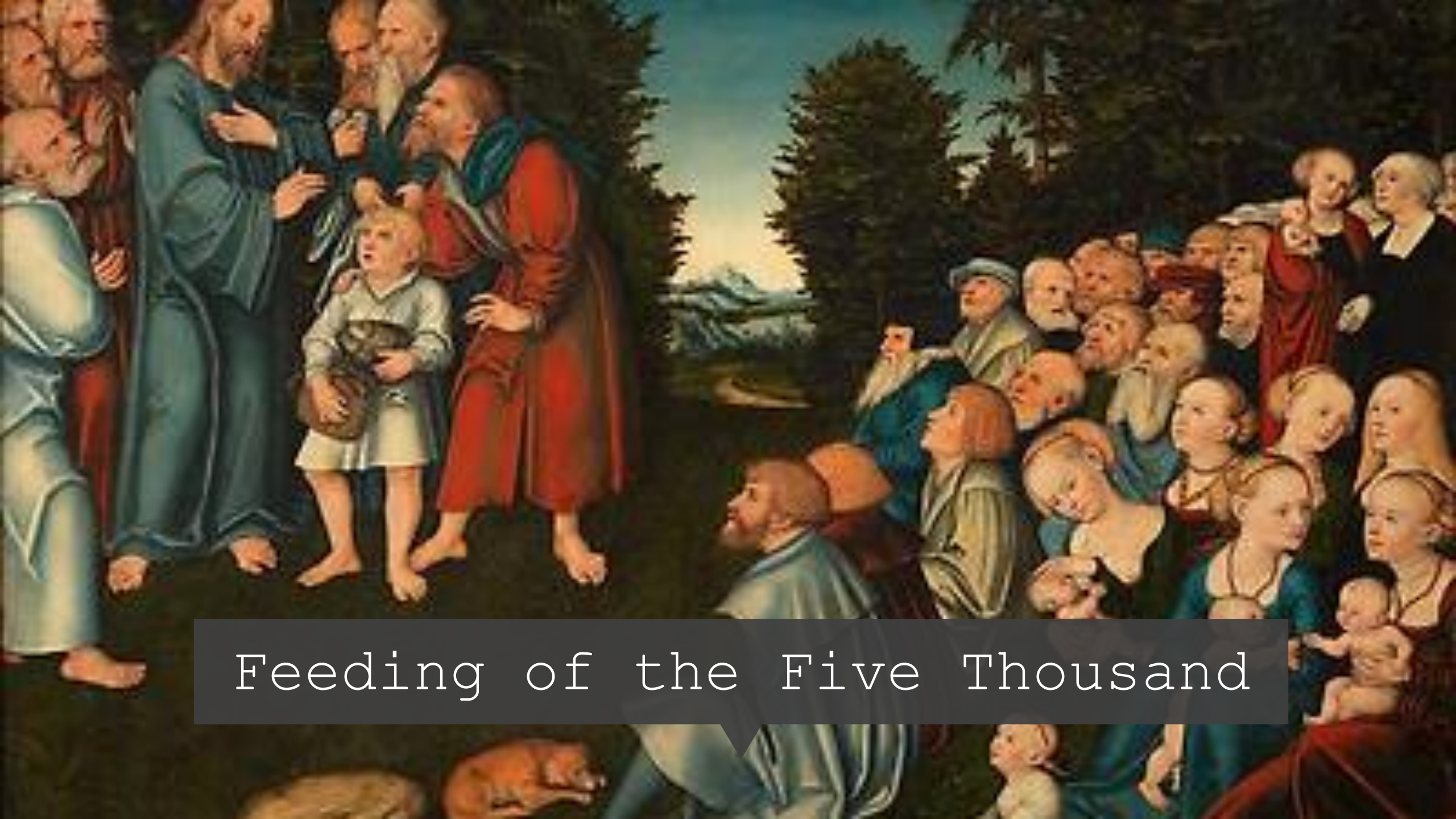
Feeding of the Five Thousand