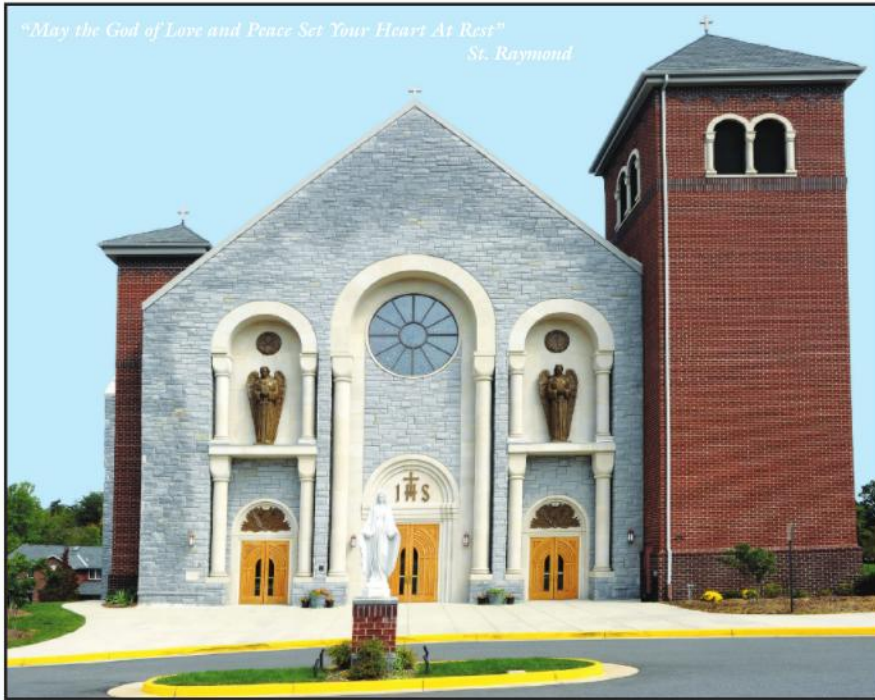
"May the God of Love and Peace Set Your Heart At Rest" St. Raymond