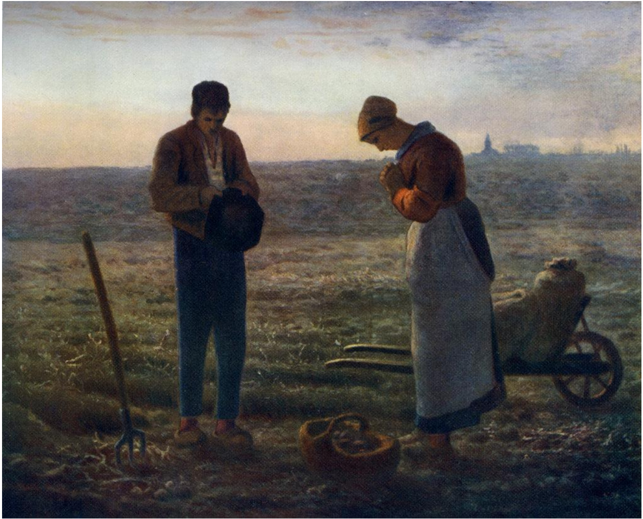
The Angelus 1857-1859 Jean François Millet

Millet said: "The idea for The Angelus came to me because I remembered that my grandmother, hearing the church bell ringing while we were working in the fields, always made us stop work to say the Angelus prayer for the poor departed."