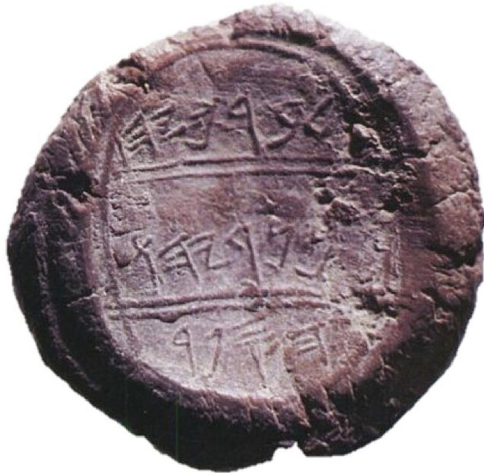
"Belonging to Berechiah, son of Neriah, the Scribe"