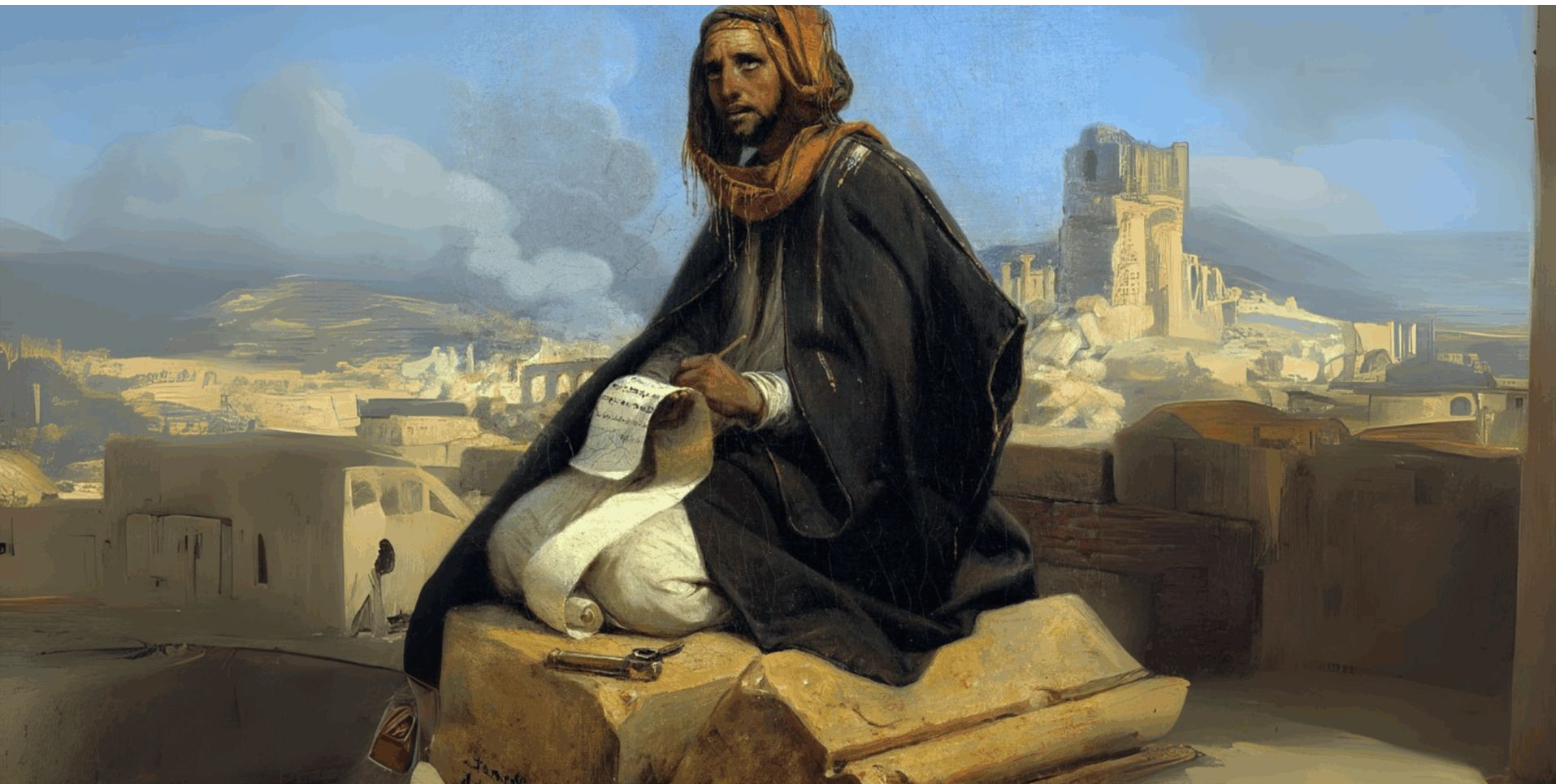
Émile Jean-Horace Vernet